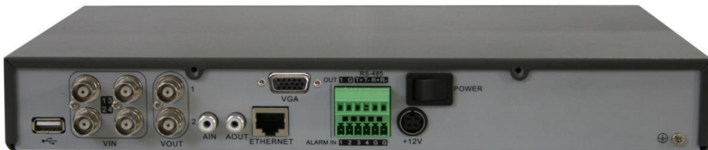
DS-7204HVI-S Rear Panel

DS-7204HVI-S series DVR includes following model: