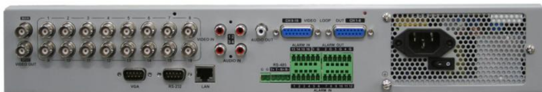
DS-7016HI-S Rear Panel

DS-7000HI-S series DVRs include following model: